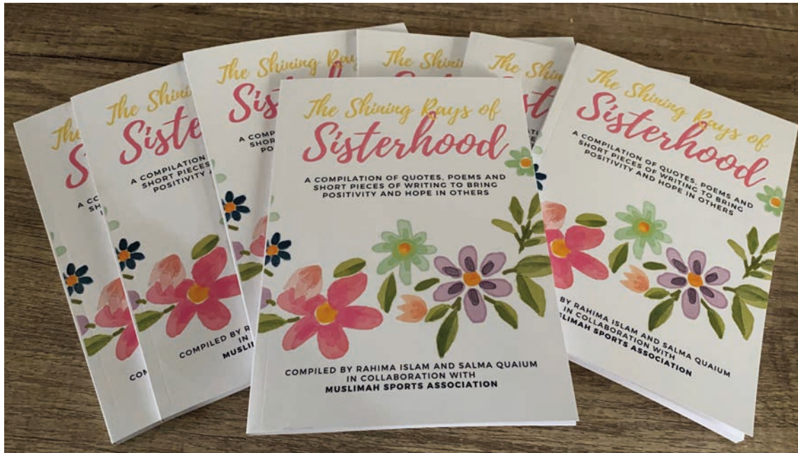
The Shining Rays of Sisterhood For more information, contact info@muslimahsports.org.uk

At MSA, we not only understand the importance of physical health but have adopted a more holistic approach, focussing on mental and spiritual well-being too. We have been running Positive Minds sessions, bringing in experts from a wide range of fields to deliver sessions and enable our participants to feel equipped with skills. These sessions were imperative during the pandemic. We also delivered life skills such as IT skills sessions to cater with the adjustment to online so that they felt more comfortable.