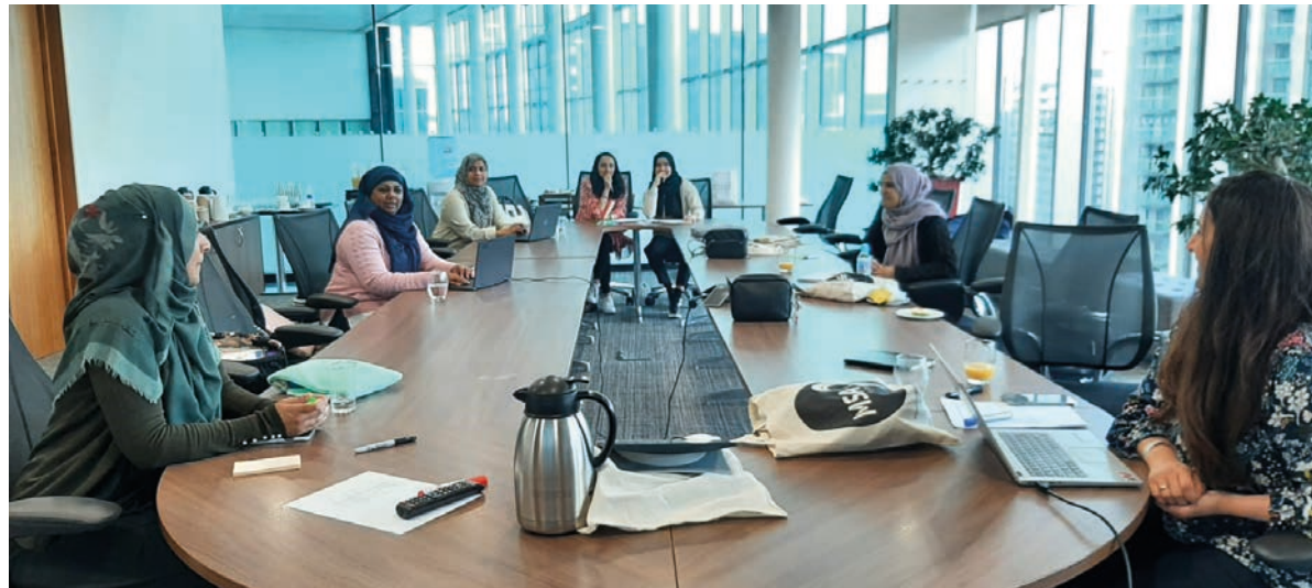
Around the table

We already have an understanding of what works and what doesn't, but we want to continue to learn and collaborate with others and share best practices reinforcing MSA's lead in the industry.