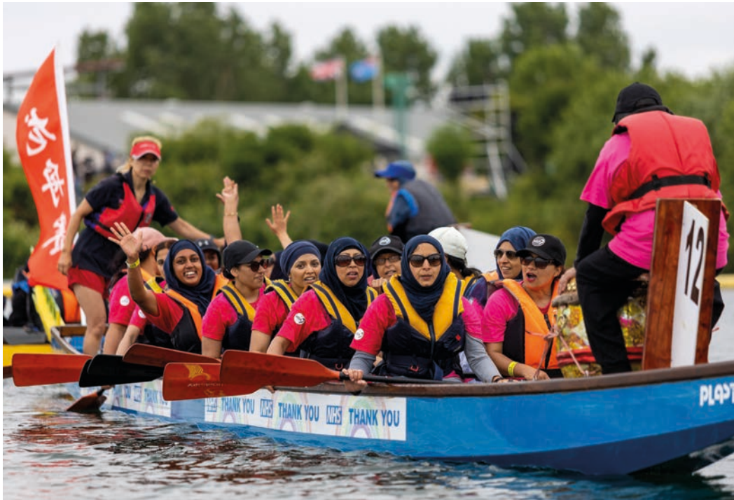
The Rowing Team