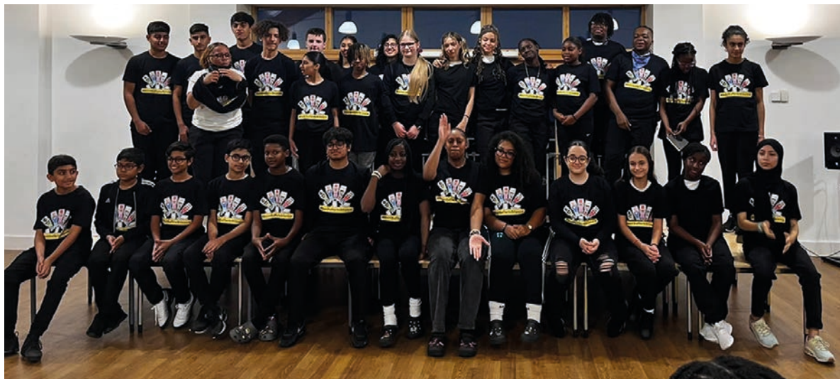
The Social Action Program

“ I think it has improved my well-being. It has helped me meet new people, socialise, and network in this community. ”