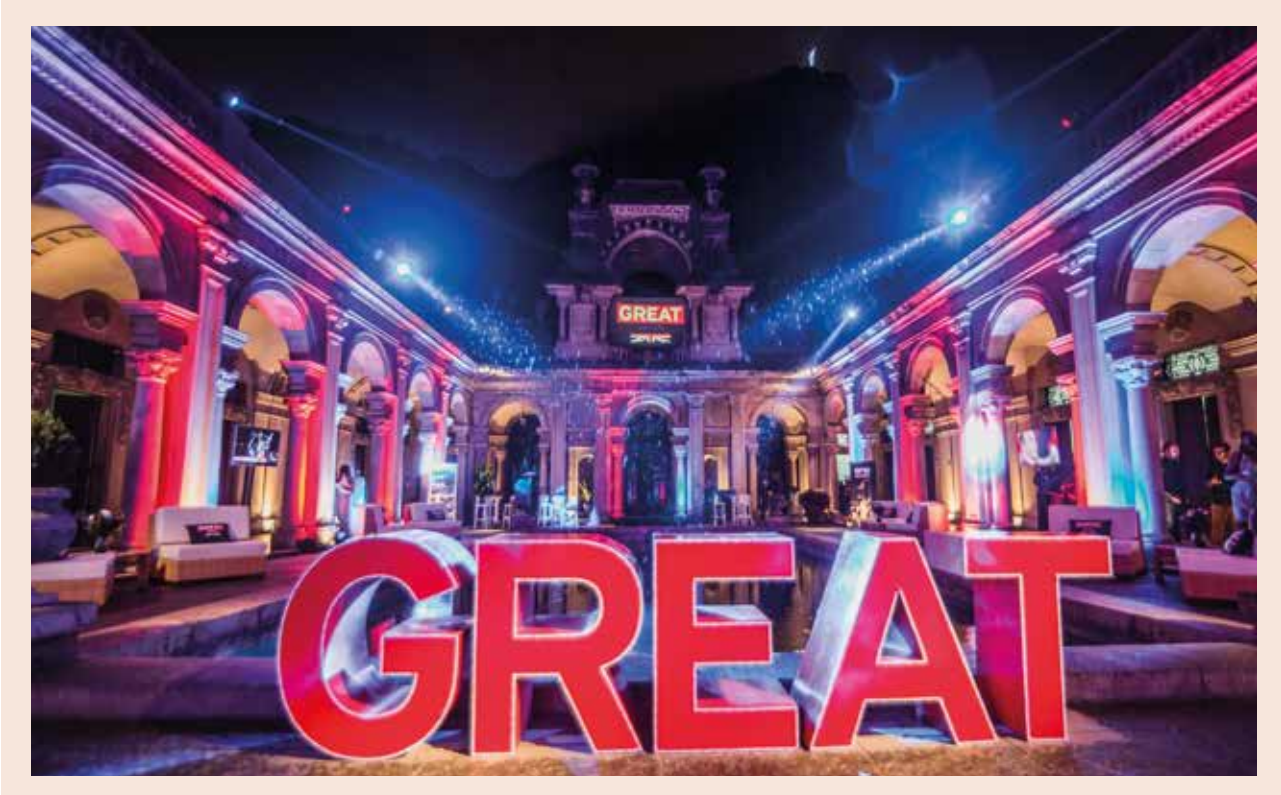
The UK government's Olympic British House, which will be delivered in partnership with the British Olympic Association and the Mayor of London, is in one of Rio's leading cultural venues. The venue has already been used for smaller events, such as the 'One year to go' celebration in 2015.

As part of a wide programme of business and cultural events, the British House during the Olympics and Paralympic Games will showcase UK expertise in delivering major sporting events from London to Rio and onwards to future hosts – in collaboration with other FCO and UKTI posts around the world, such as Tokyo, South Korea, Qatar and Russia.