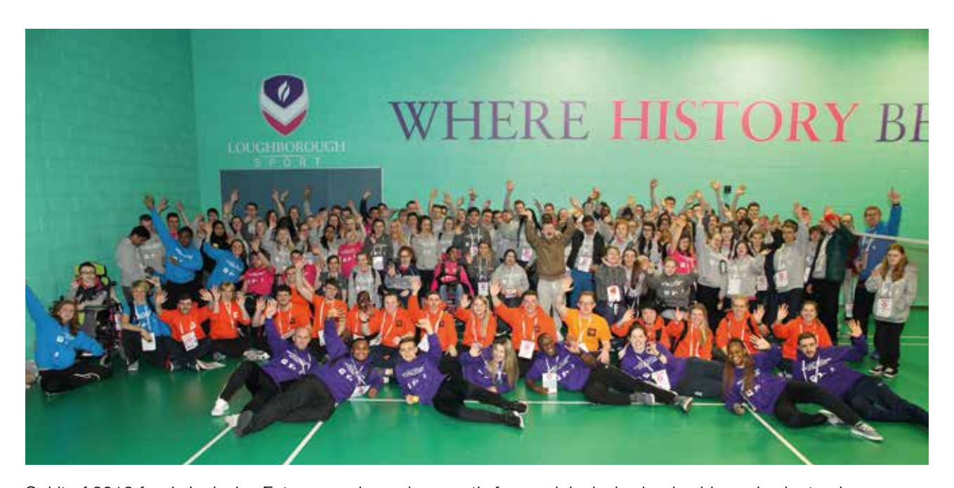
Spirit of 2012 funds Inclusive Futures, a pioneering, youth-focused, inclusive leadership and volunteering initiative delivered by the Youth Sport Trust in nine host cities across the UK