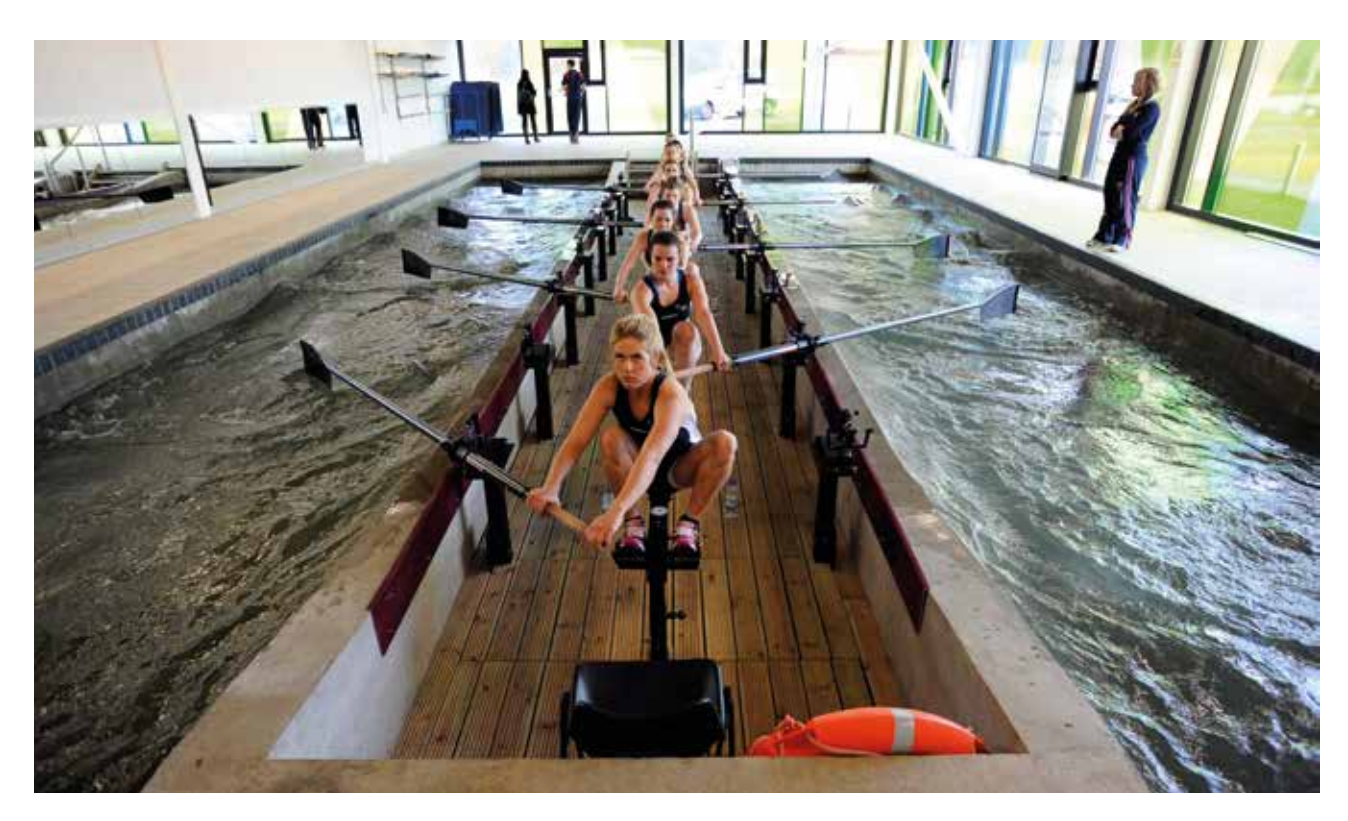
Durham University – a recipient of Sport England's Iconic and Strategic Facilities funds