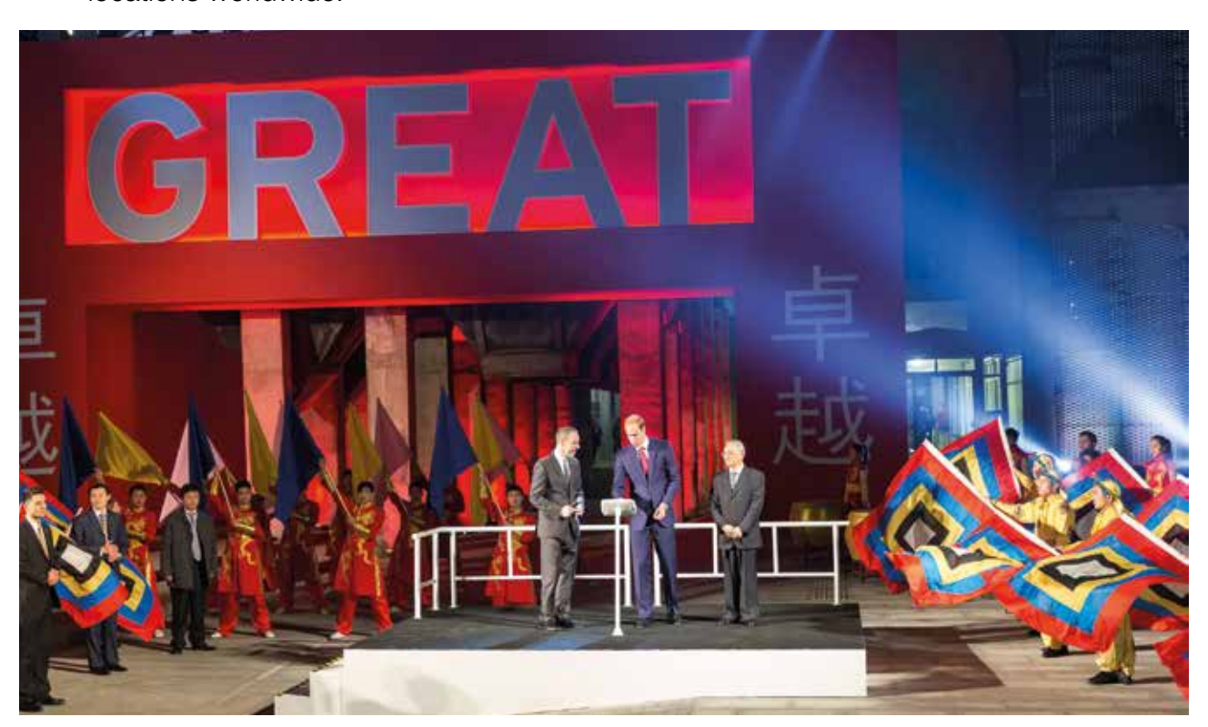
HRH Duke of Cambridge opens the GREAT Festival of Creativity, Shanghai March 2015

15 The campaign has already secured confirmed economic returns of £1.9bn for the UK, with a further £2.3bn currently being appraised and a strong pipeline of future returns worth a further £400m also being generated. Over 500 businesses and high-profile individuals are backing the brand with joint funding, sponsored activity and active support. Over £87m of value in cash and kind has been generated to date.