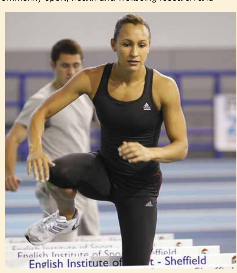
Jessica Ennis-Hill training at the English Institute for Sport Sheffield

When fully operational in 2018 up to 3,000 athletes, teams, students and researchers will use the Park every day, and at night it will be the location for professional rugby and basketball with up to 5,000 spectators.