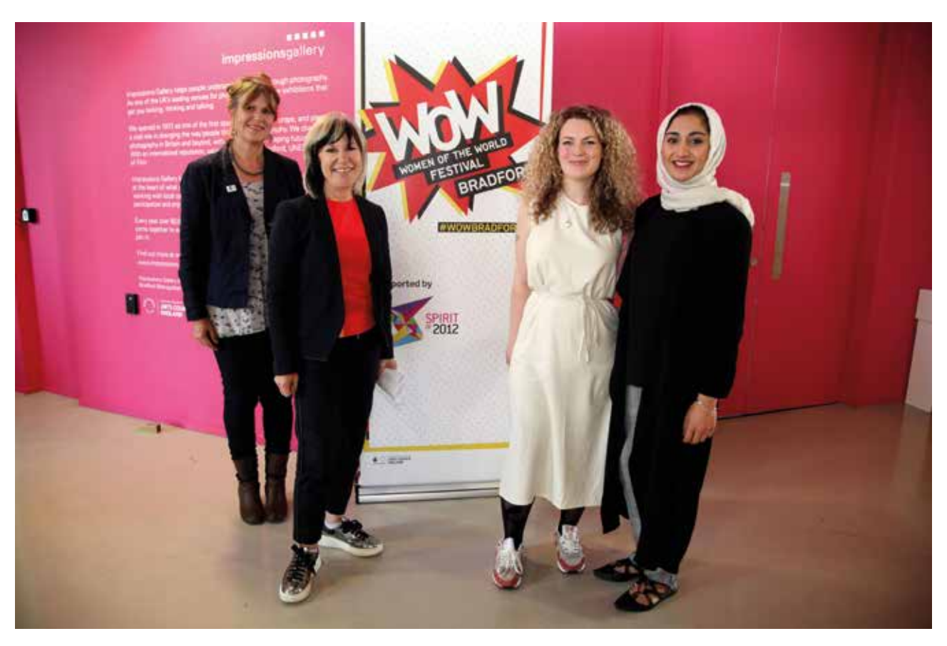
Spirit of 2012 and the Southbank Centre have launched a three-year partnership to deliver Women of the World (WOW) festivals in new locations across the UK

Youth Advisory Panel (UK wide): Spirit of 2012's Youth Advisory Panel consists of twelve young people from across the UK who ensure the youth voice is heard and represented in Spirit's decision making. The panel members meet regularly and receive coaching, mentoring and training. They were recently empowered to award two grants: to a young offenders' reading project in Northern Ireland and to a Plymouth-based intergenerational music project. Supported by Spirit staff, the Youth Advisory Panel managed the entire funding process – from the initial grant specification and criteria, to the final award decisions.