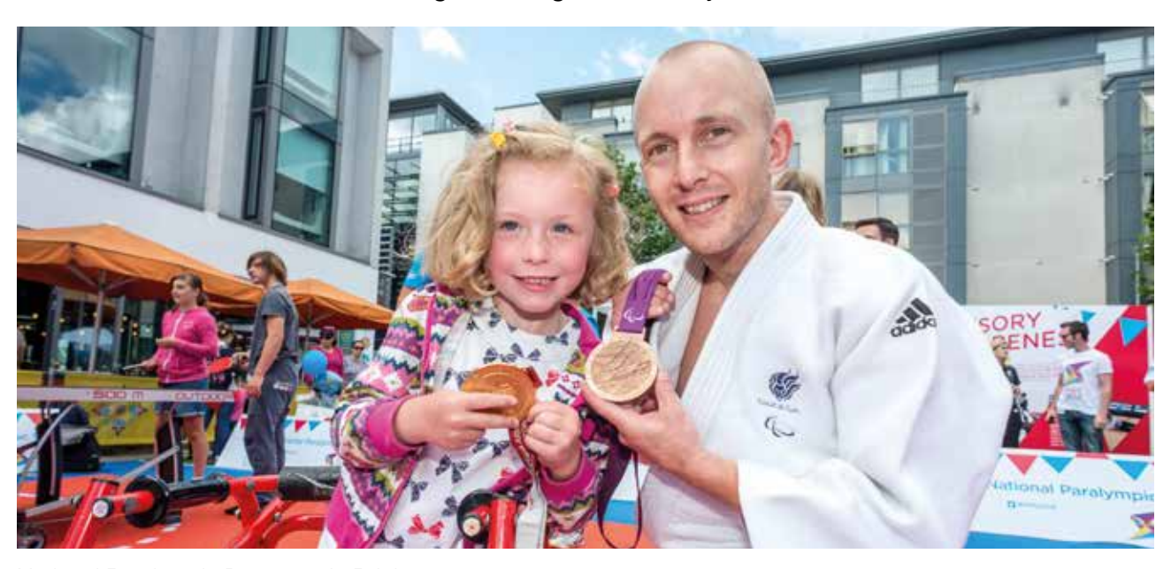
National Paralympic Day 2015 in Brighton