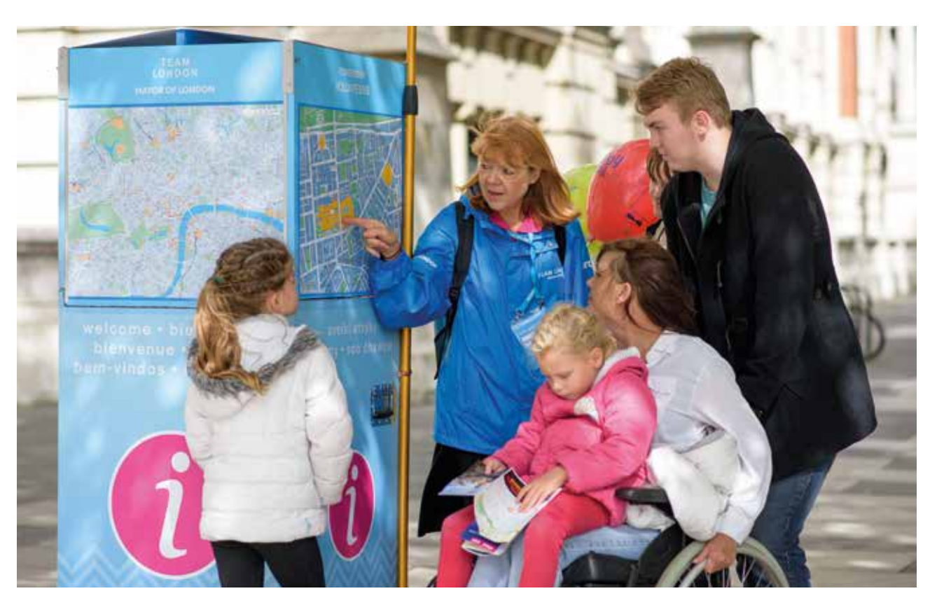
Team London Ambassadors on Exhibition Road in London