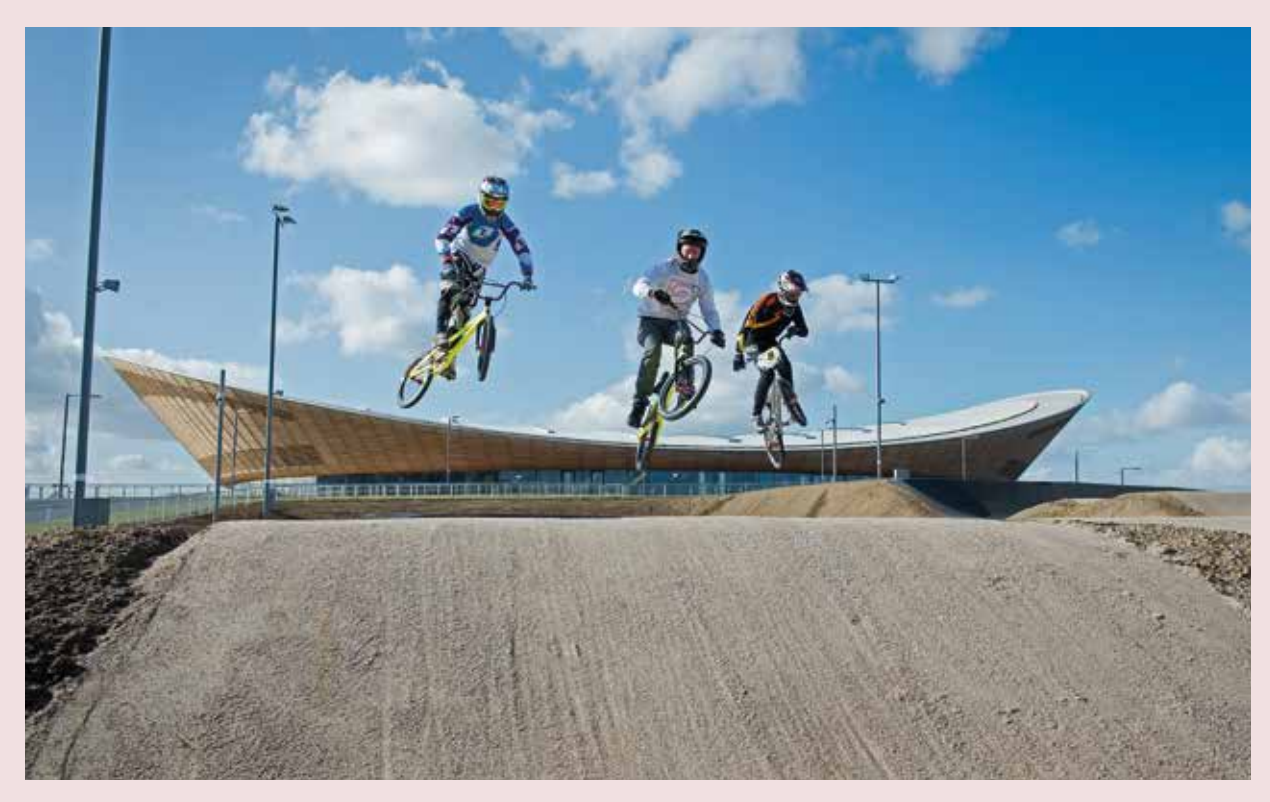
BMX at the Lee Valley VeloPark

The venue is hugely popular with major companies for initiatives such as team building days, a key revenue stream. 300 such events have been held. Other commercial initiatives include a deal with major UK bike retailer Cycle Surgery, which is the venue's Official Cycle Sports Retailer and runs a shop there.