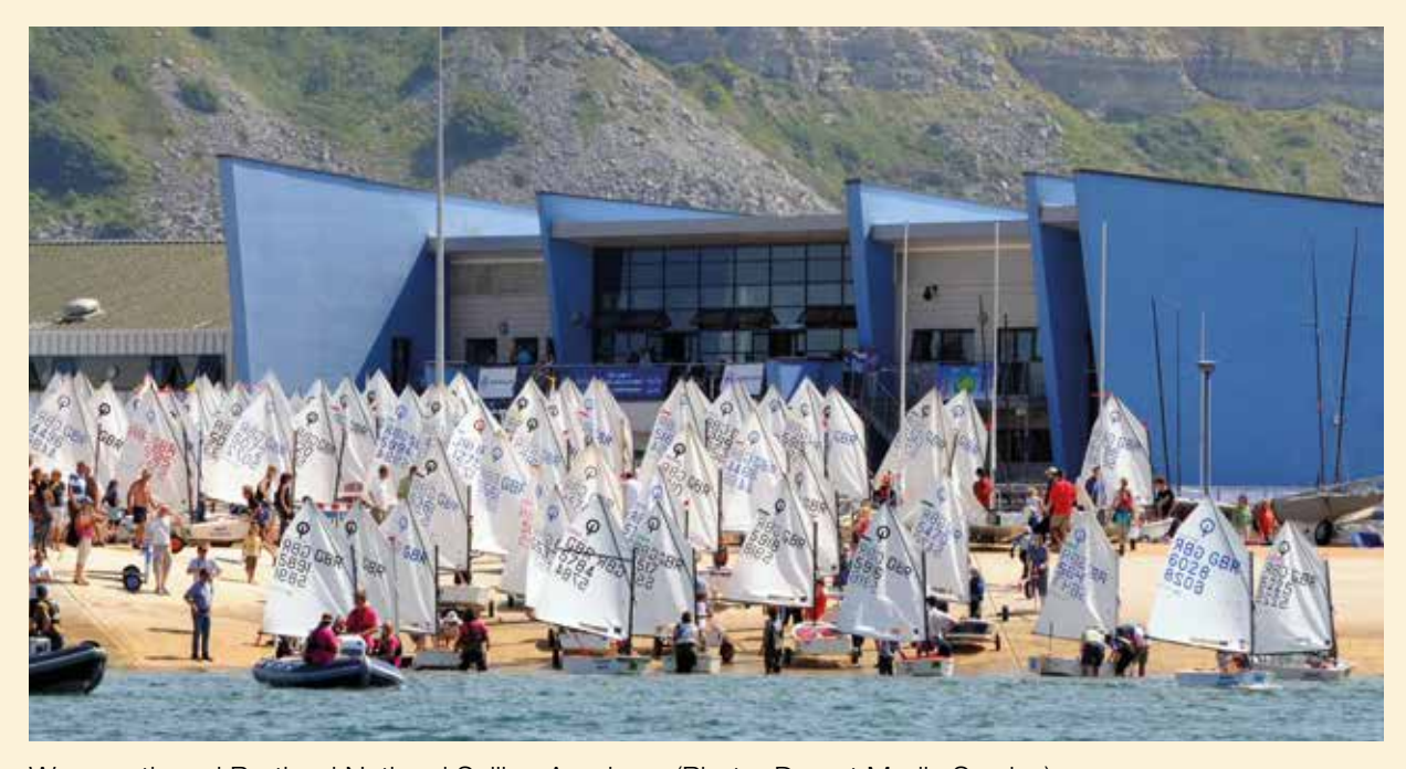
Weymouth and Portland National Sailing Academy

Sail for Gold, the annual international Olympic and Paralympic Class regatta that was held for a number of years pre-2012, has continued annually and from 2015 became one of two European legs of the Sailing World Cup.