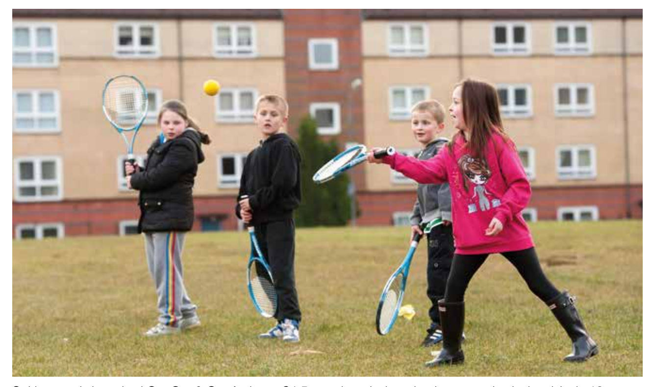
Spirit recently launched Get Out & Get Active, a £4.5m project designed to increase physical activity in 18 locations across the UK

Hull City of Culture 2017: Spirit is funding the volunteering programme at Hull City of Culture 2017, which will see 4,000 people volunteering by the end of 2018. They are also funding work that will ensure that the impact reaches, and is measured as widely as possible throughout, the city and surrounding areas.