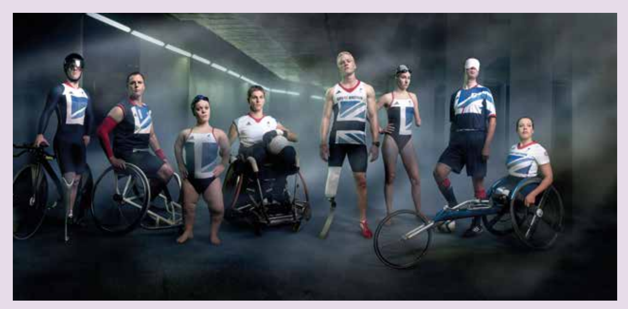
Channel 4's campaign for London 2012: Meet the Superhumans

Channel 4's approach to Paralympic coverage is part of its remit as a public service broadcaster to reflect the diversity of the UK, challenge established viewpoints and inspire change in people's lives. Almost 40 million people watched Channel 4's coverage of the London 2012 Paralympic Games (a 251% increase compared to the 2008 Beijing Paralympics). The multi-award winning coverage and marketing campaign, showcasing the Superhuman athletes, saw disability portrayed as never before.