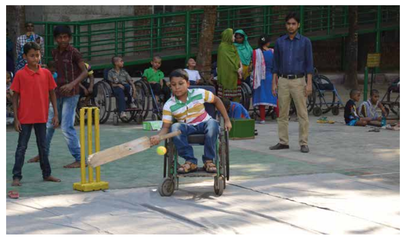
An IN cricket project in Bangladesh

32 Following on from the strong track record demonstrated by the IIP, IN separated from UK Sport in 2014 thanks to the support of the Department for International Development, and established itself as an independent sport for development and peace charity.