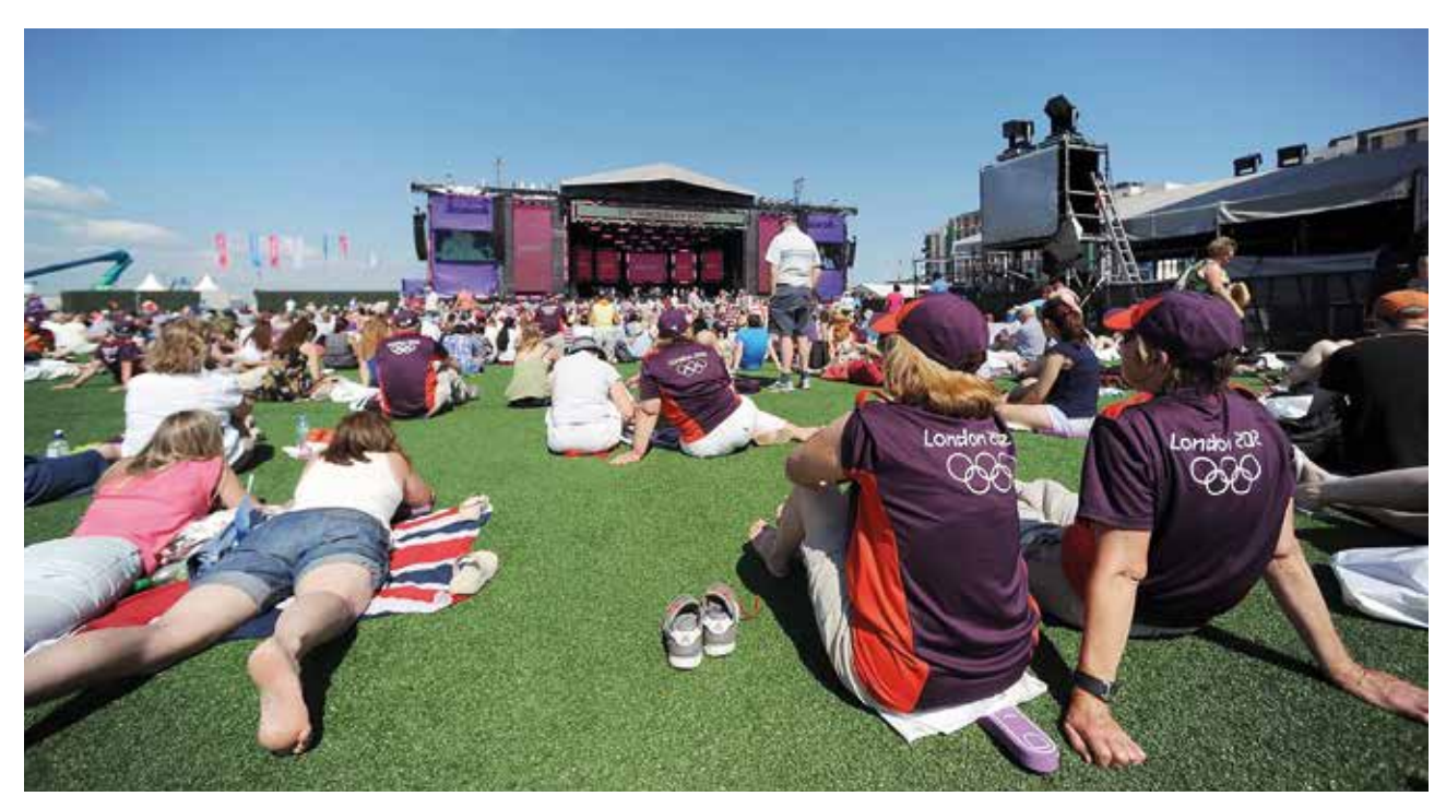
Go Local, the Join In and Mayor of London event for Games volunteers in 2013 on Queen Elizabeth Olympic Park

5 At London 2012 sports volunteers hit the headlines, when the tidal wave of energy, enthusiasm and talent brought by the Games Makers and other London volunteers became one of the highlights of the Olympic and Paralympic Games. A key legacy of the Games has been continued recognition of the contribution volunteers make to grassroots sport.