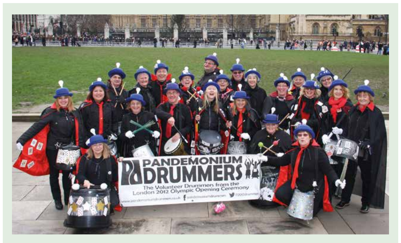
The Pandemonium Drummers

The PDs have performed and cheer-drummed at over 150 diverse, large and small, indoor and outdoor, charity and community events, arts festivals and parades. Requests come via the Pandemonium Drummers' website which links to the PD YouTube channel.