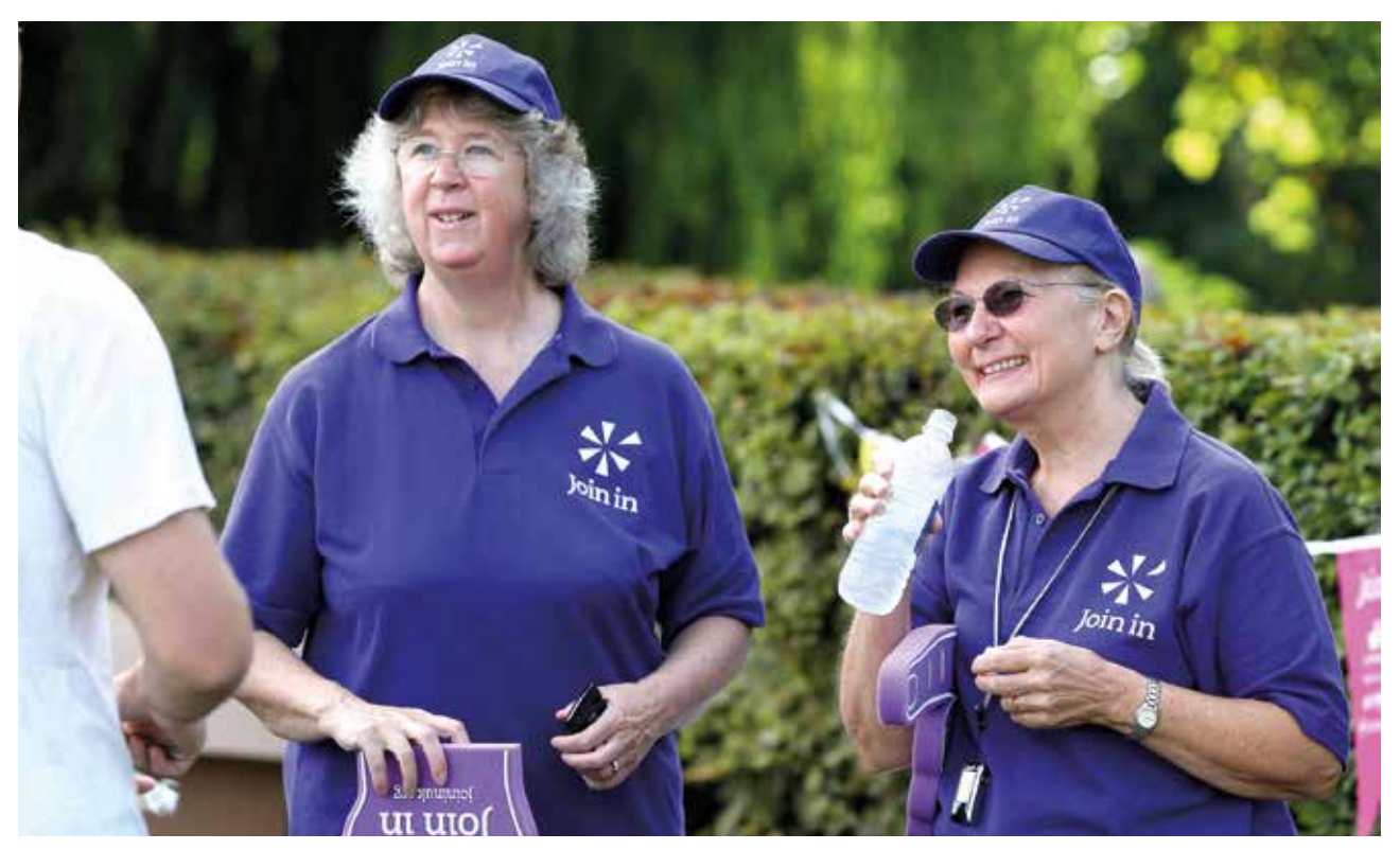
Join In Local Leaders

11 Join In forged partnerships with the private, sports and voluntary sectors to share insight into the value of volunteering and best practice for volunteering in sport. Its strong collaborative relationships with the private sector in the shape of Founding Partner BT (from 2012 onwards), Official Partners Lloyds TSB (in 2013) Big Lottery Fund (2013) and Intersport (from 2014) not only contributed funding to Join In's work but also had a positive impact on Join In's reach through campaign activity with employees and customers. Through national media partnerships with BBC and ITV, Join In has been able to further extend its reach creating over £6m of media value from a campaign spend of £300,000 in 2015 alone.