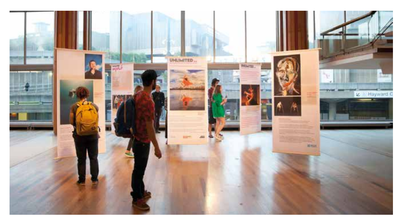
The Unlimited Festival at Southbank, London

27 The Unlimited programme has been underpinned by a range of successful partnerships not least between Arts Council Wales, Creative Scotland and Arts Council England. Artists' showcasing has been a key outcome of the programme supported by the British Council and the Southbank Centre's ongoing commitment to the inclusion of disabled people.