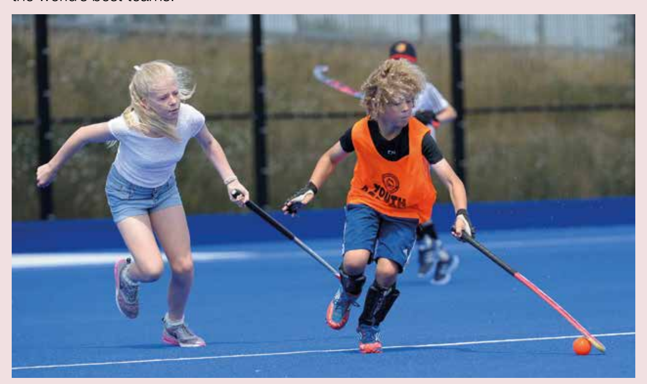
Lee Valley Hockey and Tennis Centre

During peak times 90% of the tennis courts are fully booked while special learn to play tennis programmes are held each day and throughout the school holidays. The venue has become the "Wembley" of English hockey, with national finals for players of all ages taking place there as well as high profile, international competitions that attract some of the world's best teams.