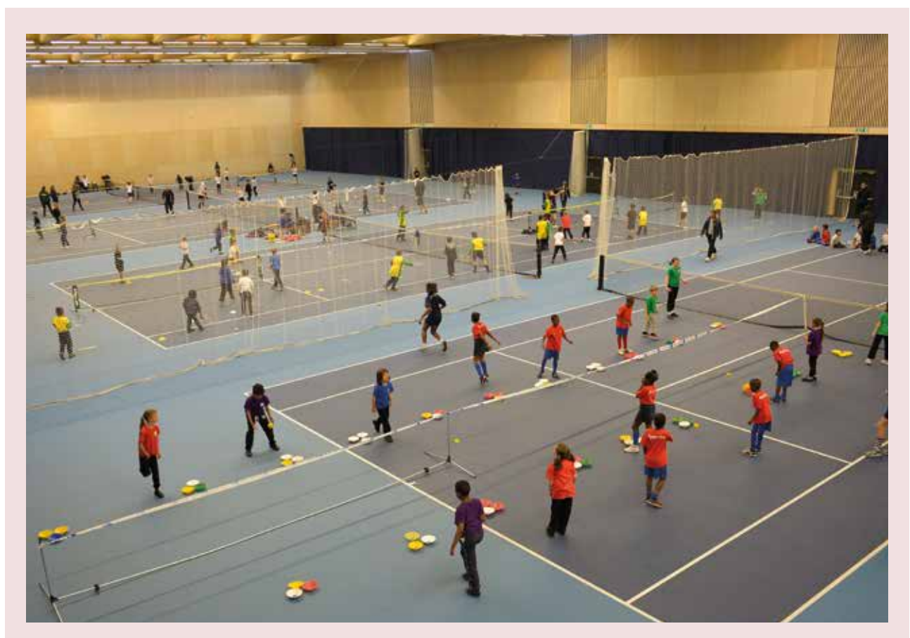
Lee Valley Hockey and Tennis Centre

Tennis programmes at the venue are designed to broaden the appeal of the sport. They include learning disabilities tennis sessions, wheelchair tennis sessions, tennis activities aimed at over 50s, school holiday tennis camps and free tennis coaching to local schools and community groups funded in partnership with the Lawn Tennis Association's charity, the Tennis Foundation.