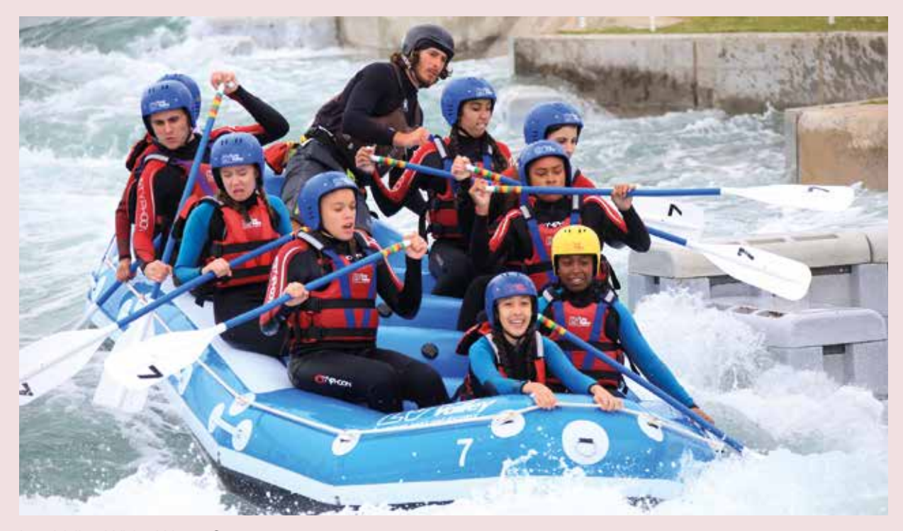
Lee Valley White Water Centre

Income raised from commercial activities has already resulted in a number of community initiatives designed to increase participation from key target groups. These include female only paddle sports development programmes, a Black and Minority Ethnic programme and a schools outreach programme.