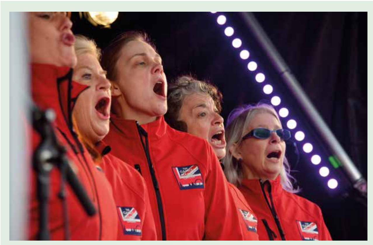
The Games Maker Choir

With an established musical director, regular rehearsals and some serious hard work, the choir gets many requests to perform around the country. In the last twelve months the choir has performed at the European Hockey Championships, twice for Rugby World Cup 2015, and back at Queen Elizabeth Olympic Park for Sport Relief 2016. It is fast becoming "the choir for sport" and is in high demand.