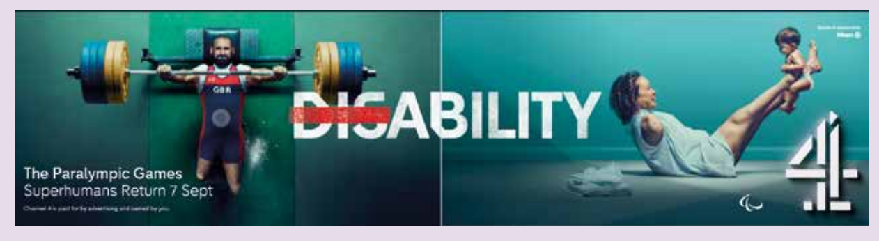
Channel 4's 2016 campaign - "We're the Superhumans"

Disabled talent will be front and centre with three-quarters of Channel 4's on-screen talent people with disabilities and over 15% of the production team behind the camera disabled talent. The 2016 ad campaign is the longest (at 3 minutes) and most inclusive ever – shot with over 100 disabled people, ParalympicsGB and non-athletes, showing a huge range of impairments and sports.