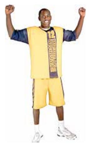
What is physical activity and sport?

Physical activity means sport, exercise and fitness. For example, walking, running, cycling and swimming. Sport is a type of physical activity.