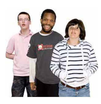
Who is the guide for?

Where you can go if you want to take part in sport and physical activity.