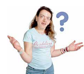
I do not know what activity to do

2 out of 3 people with a learning disability would like to do more sport and physical activity.