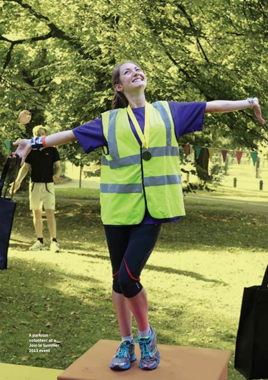
A parkrun volunteer at a Join In Summer 2013 event