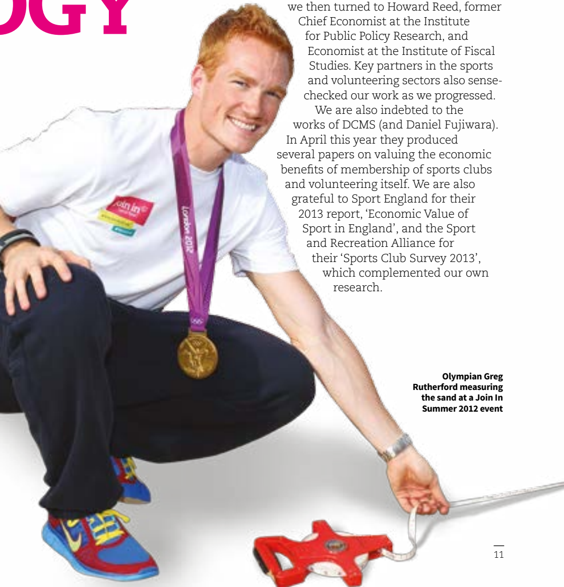
Olympian Greg Rutherford measuring the sand at a Join In Summer 2012 event